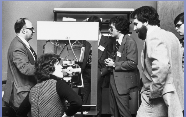
1976 Eastern Regional Workshop

As the Coordinator, you will still receive CE-credits for the course you are coordinating. Most important is the great satisfaction you will feel from participating as part of the Program and at the same time giving something back to the OPS.