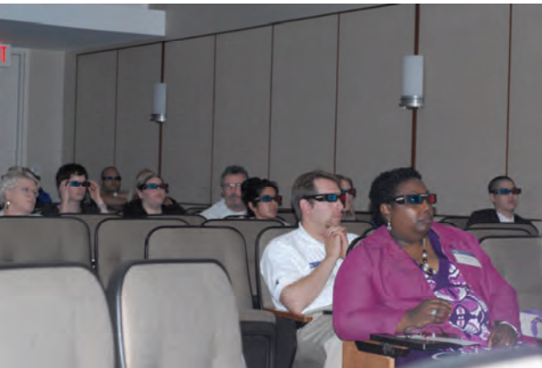
Students looking through 3-D glasses at a stereo lecture